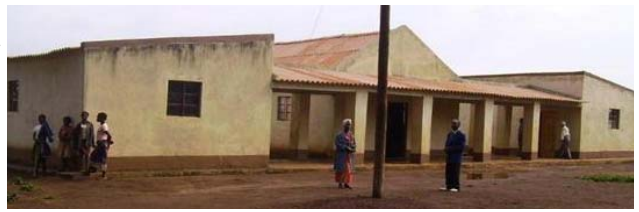
Chillesso School for Young Women

In all our travels through Bie Province the Ovimbundu people made it clear that education is a high priority for their communities. In Chillesso there are 963 students enrolled in 3 schools, under the guidance of 19 teachers; they attend in 2 shifts – morning and afternoon. The students in the lower three grades have classes in the Swanson School building, now nearly roofless with many walls and floors in deplorable condition. Chillesso has no funds to rehabilitate this school and there are no government funds for school repairs. The government has built a school in Chillesso where the upper level students have classes. The Chillesso School for Young Women, built with Dille-Dunbar Foundation funds, has 2 classrooms, an auditorium and 2 offices for the teachers. The school has a capacity for over 100 students and currently has 9 teachers. Of the 963 students in the 3 schools, about 50 are residential students, currently housed in buildings that need extensive repair.