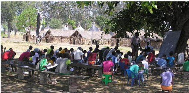
Class in Camundongo

In Camundongo students meet under a huge tree sitting on adobe blocks or small stools they bring with them. The teacher uses a “blackboard” (a board painted black) propped against the tree trunk on which she writes information. When the rains come, small “buildings” with thatched roofs and walls serve as leaky classrooms. The students in the young women’s school have housing and food problems that have caused enrolment to drop this year from 50 to 36; many come from a great distance and can’t bring