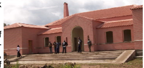
Rehabilitated Former Sanders Primary School, Camundongo